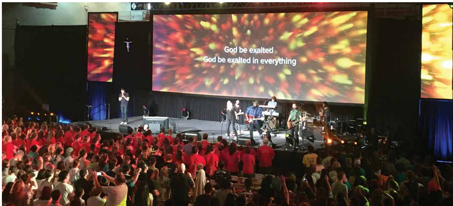
Brooklyn Catholic Youth Day, April 2015.