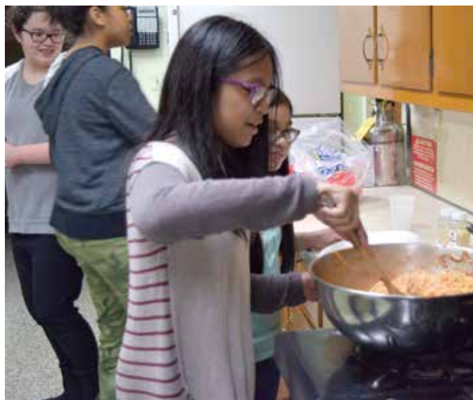
The Youth Ministry Program at St. Nicholas of Tolentine in Jamaica, Queens, hosts a spaghetti dinner for the community.

fellow parishes, but our hope is to also establish a strong youth ministry program in each individual parish. These programs are designed to keep the youth of the Catholic Church engaged and to pave the way for them to become the future leaders within our community of faith.