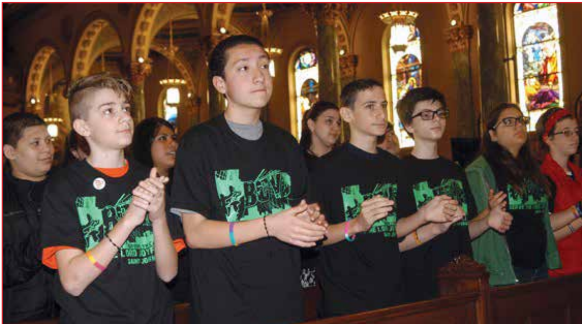
Students attend Brooklyn Catholic Youth Day in April 2015.

As much as we unite all our parishes throughout the Diocese, we also encourage and guide the youth ministers in establishing weekly and monthly meetings or events at their own parishes. We wish to remain connected with our