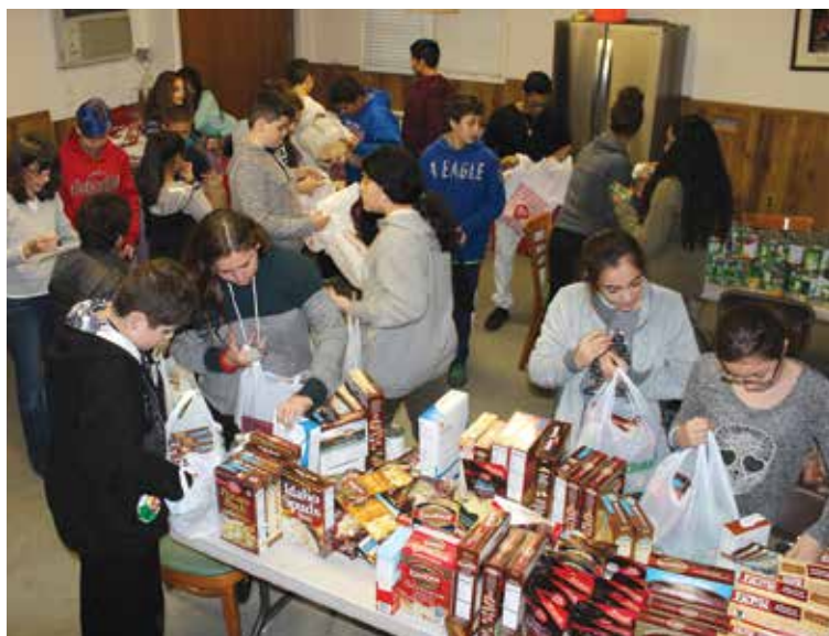
Holy Trinity Youth Ministry Group sets out to accomplish the "100+ Meal Challenge" for Thanksgiving 2015.