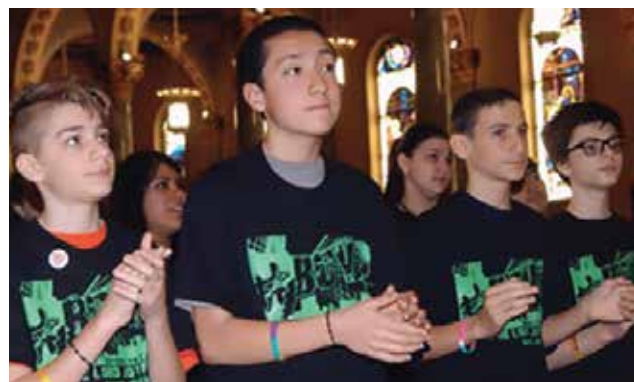
Students at Brooklyn Catholic Youth Day in April.