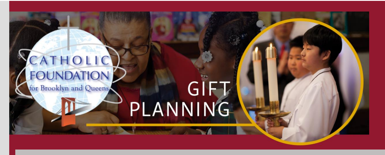
Wednesday January 12, 2022

Beginning a new year is a great time to plan for your future. This year, give yourself the gift of peace and predictability. With so much uncertainty in the world, would you like the comfort of beginning this year (and every year) with a more certain future? We have tools and ideas that will help you bring more reliability and dependability to your year and your life. A more dependable new year gives you: