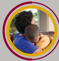
How to Give