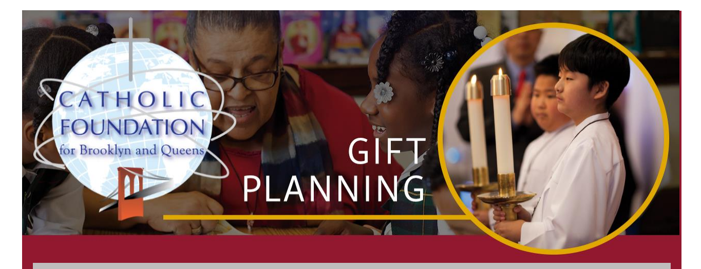
Wednesday, September 7, 2022

There is no better time than now to think about your future. As you do, reflect on all you have done with your life. You are important to your family, your friends and to the causes you give to and support.